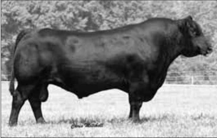
KMK Alliance 6595 187