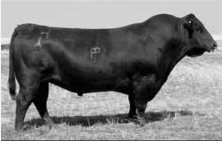
H A Image Maker 0415