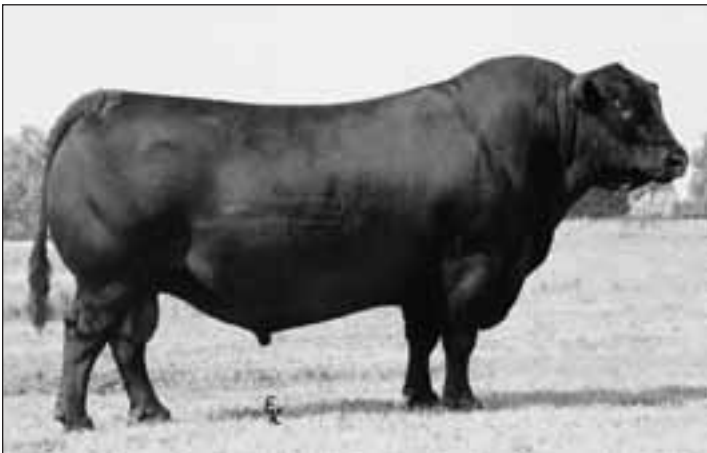
SAV Final Answer 0035

ABS Sire - With a stacked maternal pedigree and impressive phenotype 187 provides outstanding performance, thickness and fleshing ability. 187 is moderate framed and known for his females. He also excels in feed efficiency.